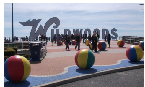
The "Wildwoods" sign on Rio Grande Avenue

Have you heard that the city of Wildwood may be replacing the W tree on its Seal with the W from the new Wildwoods sign? What do you think?