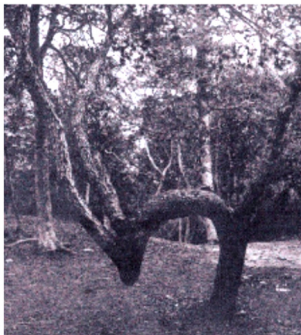
The original "W" tree

It's been 75 years since the tram cars were introduced by Greyhound Lines at the 1939 New York World's Fair. These battery operated vehicles have been relieving weary Wildwood visitors since June 11, 1949. They transport guests up & down the 2 mile long boardwalk. Five of these tram cars will be retired from the fleet this year and the Wildwood Historical Museum is preparing to add one of these workhorses to our showroom. Our biggest struggle may be getting it through our doorways, but we will find a way to put it on display! Stop in soon to "Watch the Tram Car, please!"